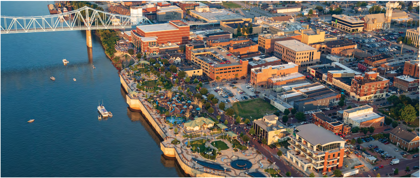
The City of Owensboro sits on the Ohio River in western Kentucky, roughly two hours from both Louisville and Nashville. It is home to the Bluegrass Music Hall of Fame & Museum, a revitalized riverfront highlighted by Smothers Park, and a longstanding bluegrass and barbecue tradition.

“This means more to me than having my master’s degree. This touches what I do every single day.”